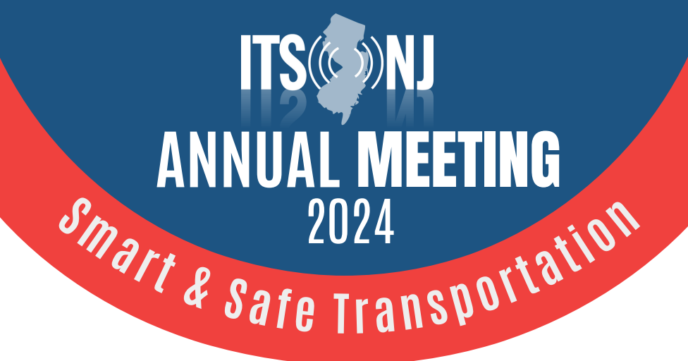
Exhibit Space for ITSNJ Members: $1000*

*Non-Members pay $1500 (but get 15 months of ITSNJ membership included!)